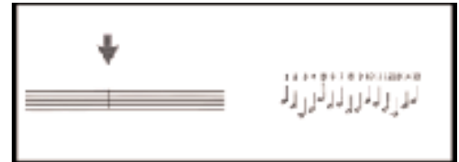
Slide #8 (2000-012) FAR Lateral Phoria (1 Diopter Increments)