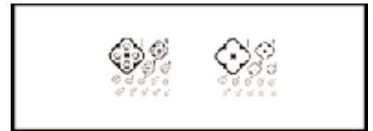
Slide #11 (2000-006) Near Acuity Left Eye Monocular (20/200-20/13)