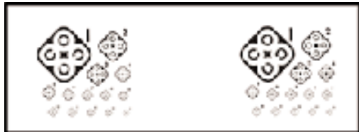
Slide #2 (2000-001) FAR Acuity Both Eyes Binocular (20/200-20/13)