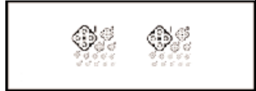
Slide #9 (2000-002) Near Acuity Both Eyes Binocular (20/200-20/13)