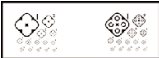
Slide #3 (2000-008) FAR Acuity Right Eye Monocular (20/200-20/13)