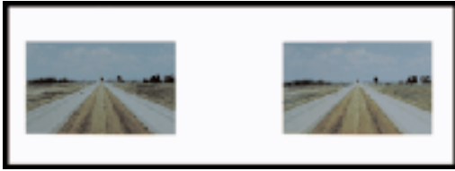
Slide #1 (2000-147) Demonstration Highway

Industrial: For complete occupational screening using accurate and easily understood targets to help determine effective vision. Includes Purdue Job Standards Booklet to easily identify pass/fail results for all occupations. Intermediate Lenses available for VDT operators, which is the fastest growing population in the industry today. Now test Far Point, INTERMEDIATE Point, and Near Point.