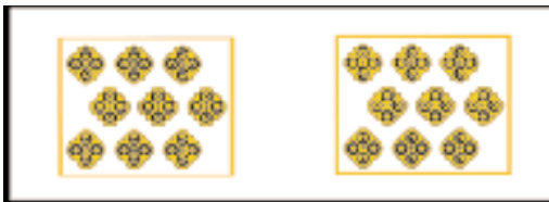
Slide #5 (2000-024) FAR Stereo Depth Perception (400-20 Seconds of Arc)