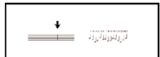
Slide #12 (2000-013) Near Lateral Phoria (1 Diopter Increments)