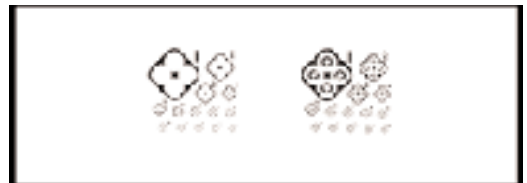
Slide #10 (2000-009) Near Acuity Right eye Monocular (20/200-20/13)